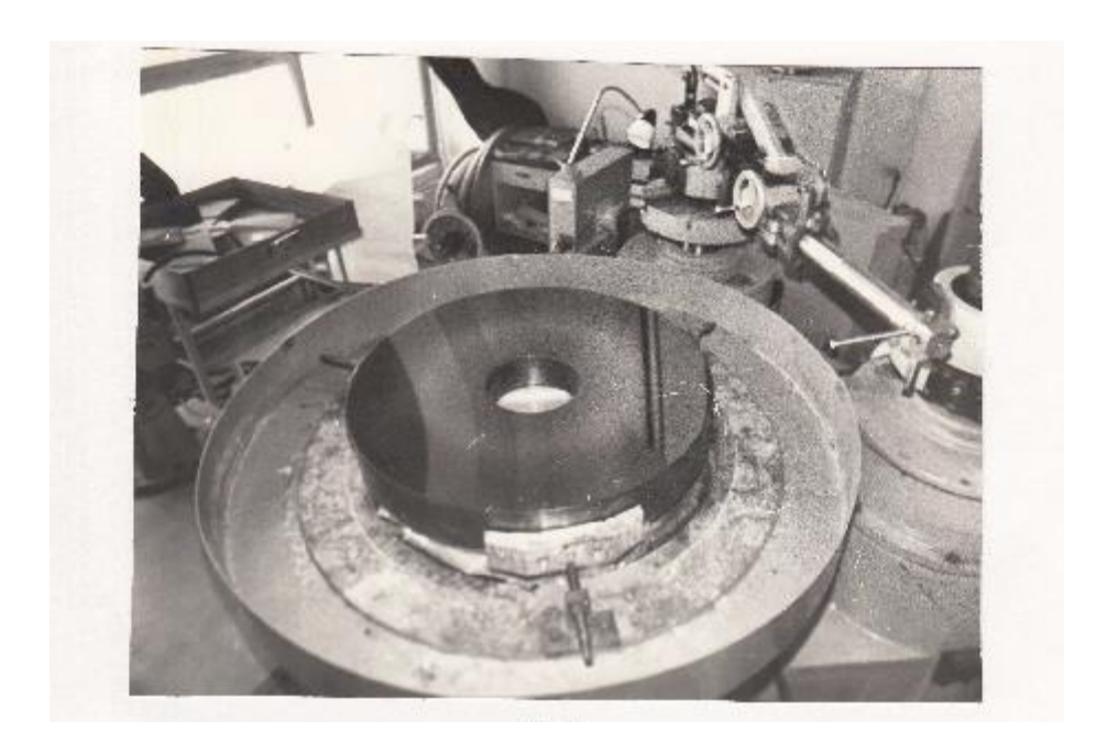
Fig. 4. Big size SiC mirror under polishing

The above trends require maximum concentration of intellectual and financial resources. We already understand well the physical and technical problems encountered in the construction of highly heat-sink components. The evident advantages of technologies involving phase-locking of LD arrays have been demonstrated, which has made it possible to develop new approaches and to implement a range of ideas included in the above list.