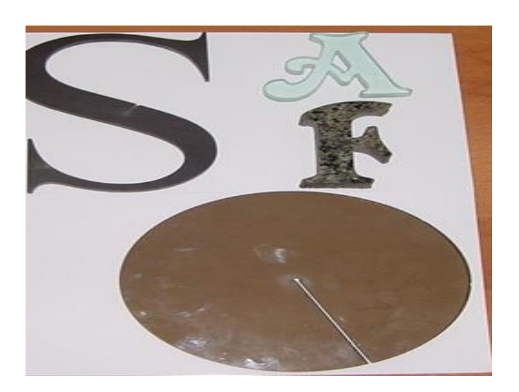
Fig.3. Laser cut examples of technology (glass, composite, stone, sitall)

There are still possibilities to further improve these "power optics." By changing the pressure of the coolant it is possible to force it to boil at room temperature. This is within the conditions similar to those of the final treatment of the mirror's surface. During the boiling of the coolant, part of the absorbed heat is used for steam formation, thus heat removal efficiency is tens to hundreds of times higher than within convective heat transfer. Steam can easily penetrate into porous capillary substrate structure.